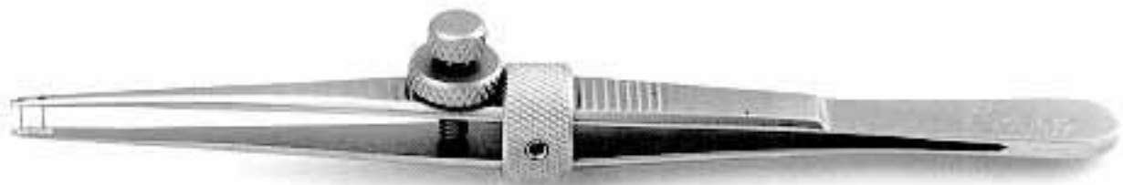
Catalog # KS-300-S