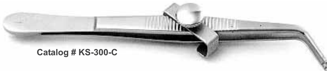
Catalog # KS-300-C