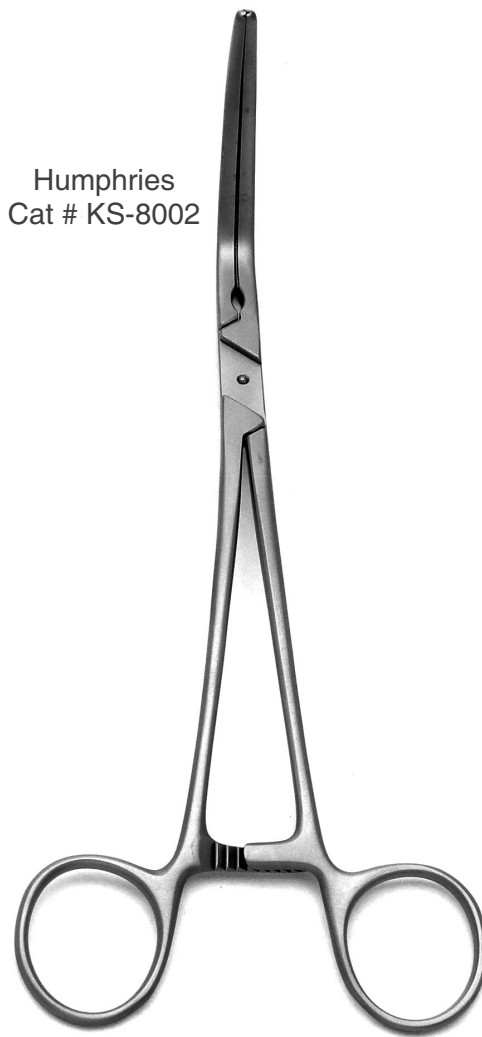
Humphries Cat # KS-8002